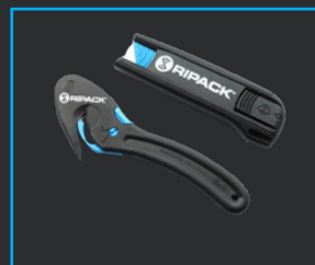
EASY KNIFE AND SAFEKNIFE CUTTERS